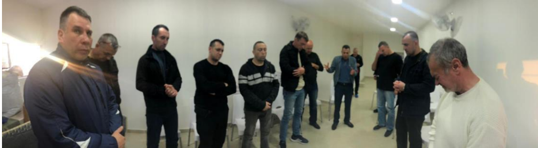
Prayer meeting with some leaders at the first floor

Above all things, we thank God for His constant provision of all our needs. We warmly praise God for all of you brothers and sisters for your involvement and for standing with us and give the glory to Him that brought you into our lives to be coworkers through support and prayers in such an important work that can only be accomplished through the joint efforts, commitment and love for the work of God. We appreciate all of those who make the effort of coming to this land from abroad to offer practical assistance.